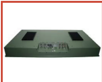
MOJAVE RD40 rear side