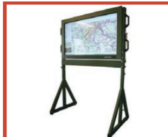
MOJAVE RD40 with Stands