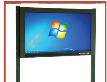
MOJAVE RD46 with Stands